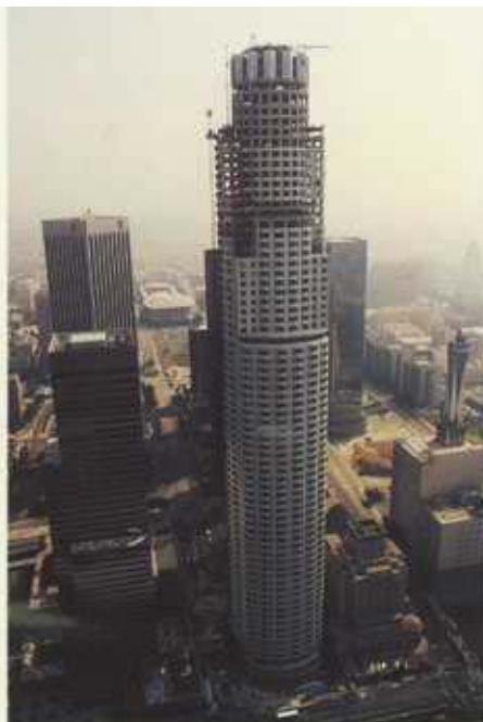
First Interstate World Trade Center: Los Angeles, California (75 Stories) Architect: I.M. Pei & Partners Structural Engineer: CBM Engineers, Inc. General Contractor: Turner Construction Company